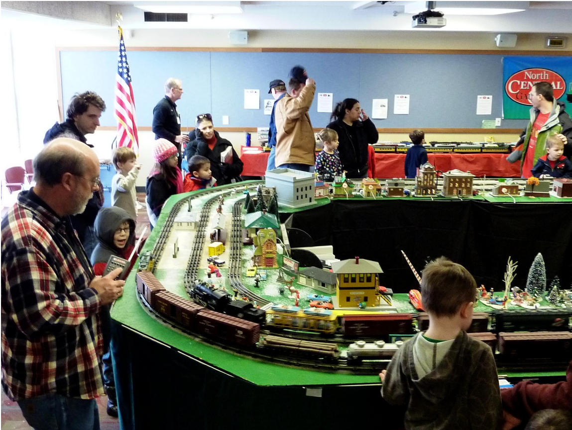
Trains run at Crystal Lake Public Library in January 2011.